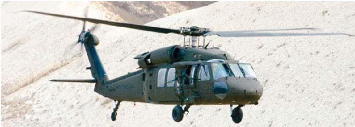
UH-60M Black Hawk Helicopter

TAPO incorrectly funded task order USZA22-03-C-0056-2237 with procurement funds, when it should have funded the task order with RDT&E funds. The task order increased the performance envelope of a major end item already in production and required the developmental testing of the new prototype.