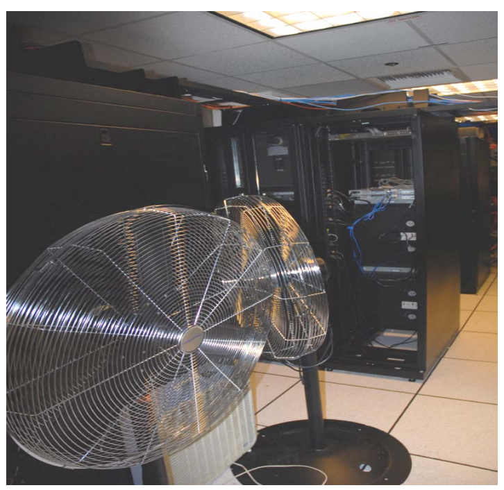
Figure 2. Fans Cooling Server Equipment

Preventative measures such as the use of locks, limited access, and proper heating and ventilation are essential to safeguard personal property. These controls help prevent theft, loss, and damage of personal property items. AFIS should secure personal property storage areas, limit access to storage areas to only authorized personnel, and install proper heating and air conditioning units in the server room.