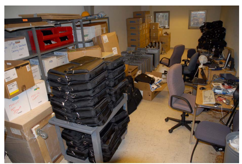
Figure 3. Laptop Computers Purchased and Kept in Storage

We found 151 (valued at about $225,000) of the 215 laptop computers stored in a room at AFIS Headquarters, Alexandria, Virginia. As of June 4, 2008, AFIS had distributed 170 laptop computers to AFIS offices, but lost two of the laptop computers. Figure 3 shows the stored laptop computers.