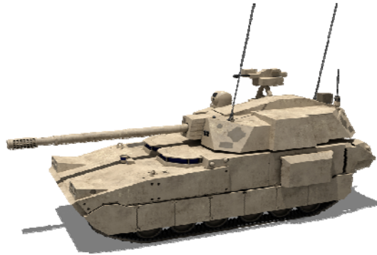
(U) XM307 Weapon Mounted on a Future Combat Systems Manned Ground Vehicle

precision, 25-millimeter, airbursting ammunition; a 25-millimeter armor-piercing ammunition; and a nonconventional, lightweight design. The Army plans to use the XM307 on selected Future Combat Systems (FCS) vehicles. The figure below shows the XM307 weapon mounted on an FCS Manned Ground Vehicle.