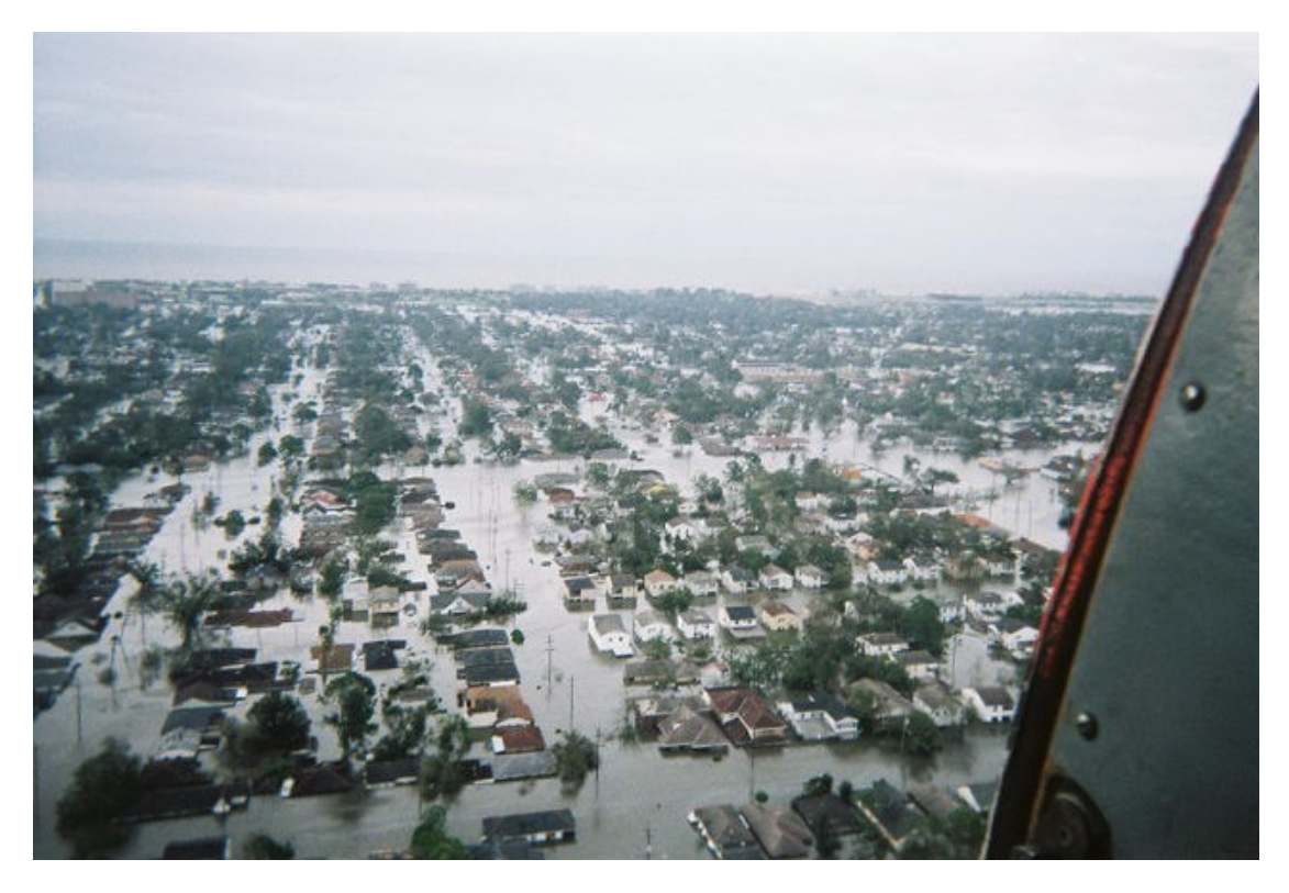
Above & Below: View from RADM Duncan's helicopter of major flooding over-topping all of New Orleans.