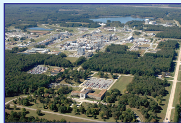
Arnold Engineering Development Complex

The 704th Test Group, added to AEDC in December of last year, is not part of this economic impact assessment, but will be added in 2017.