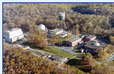
Hypervelocity Wind Tunnel 9