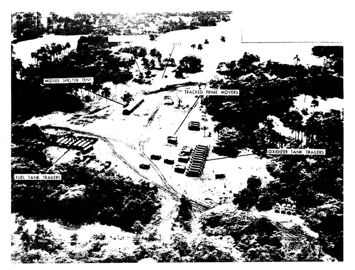
Photo taken by RF-101 of ground-to-ground missile base in Cuba, November 1962.

photographs of missiles and related equipment on docks at Cuban ports, the loading of Soviet freighters, and the deck cargo of Soviet ships entering and leaving Cuban ports. Consequently, the President of the United States was constantly aware of Soviet actions regarding the withdrawal of the missiles from Cuba.